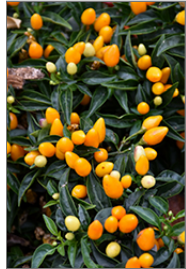
Sedona Sun Ornamental Pepper fruit

Sedona Sun Ornamental Pepper is an herbaceous annual with an upright spreading habit of growth. Its medium texture blends into the garden, but can always be balanced by a couple of finer or coarser plants for an effective composition.