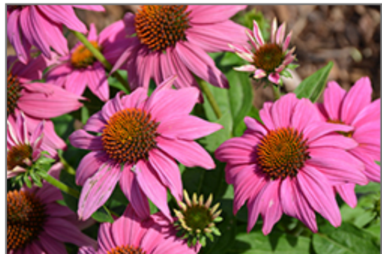
PowWow Wild Berry Coneflower flowers